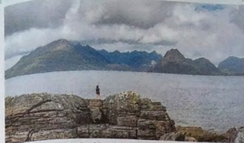
Storm clearing at Elgol

We meet on Wednesday evenings at 7pm, Townend Community Centre, Dreghorn.