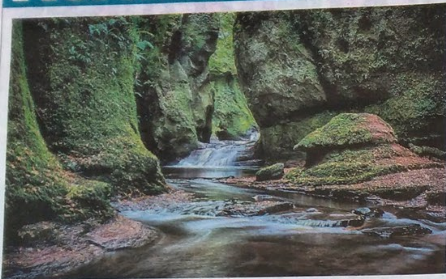
The Pulpit By Jakki Kyle