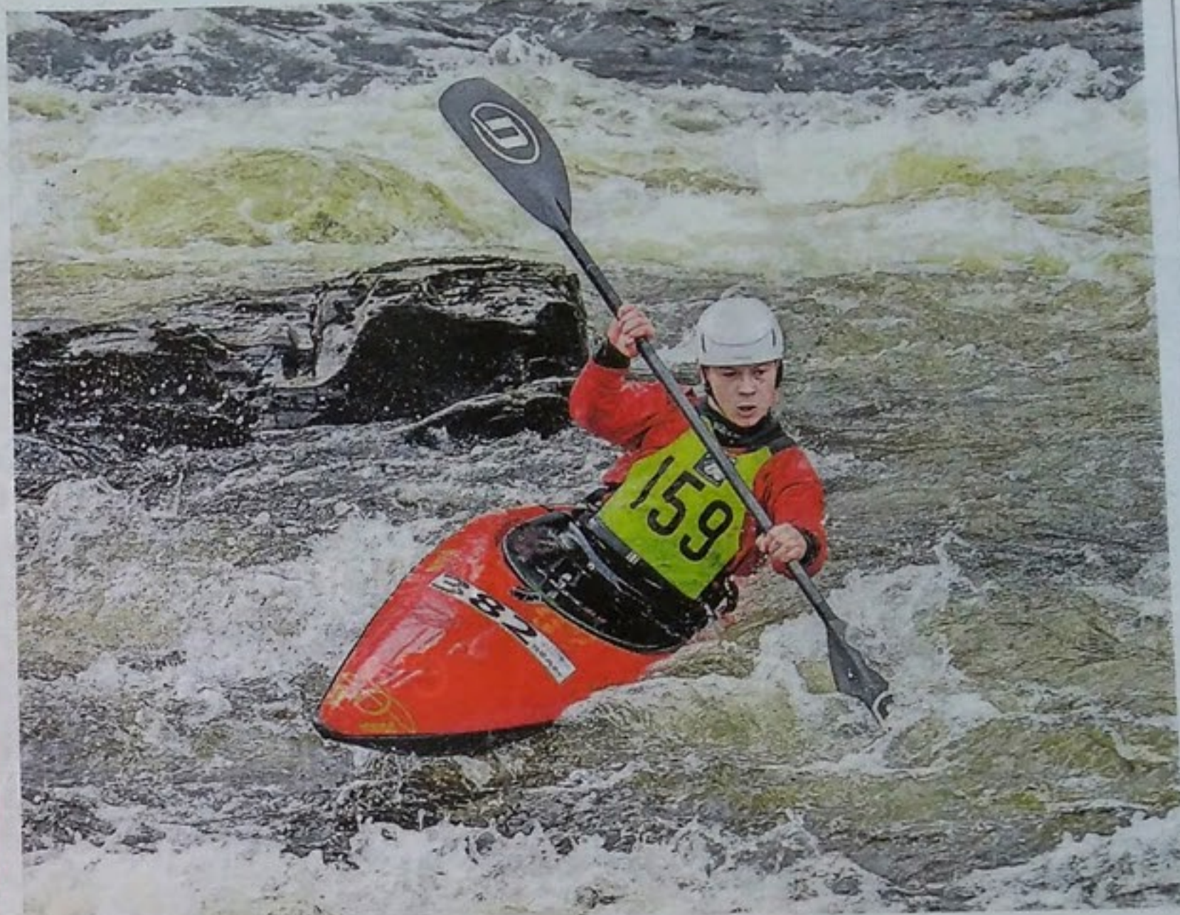
Hard left